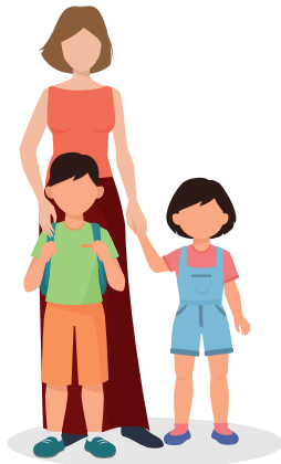
Single Parent Households