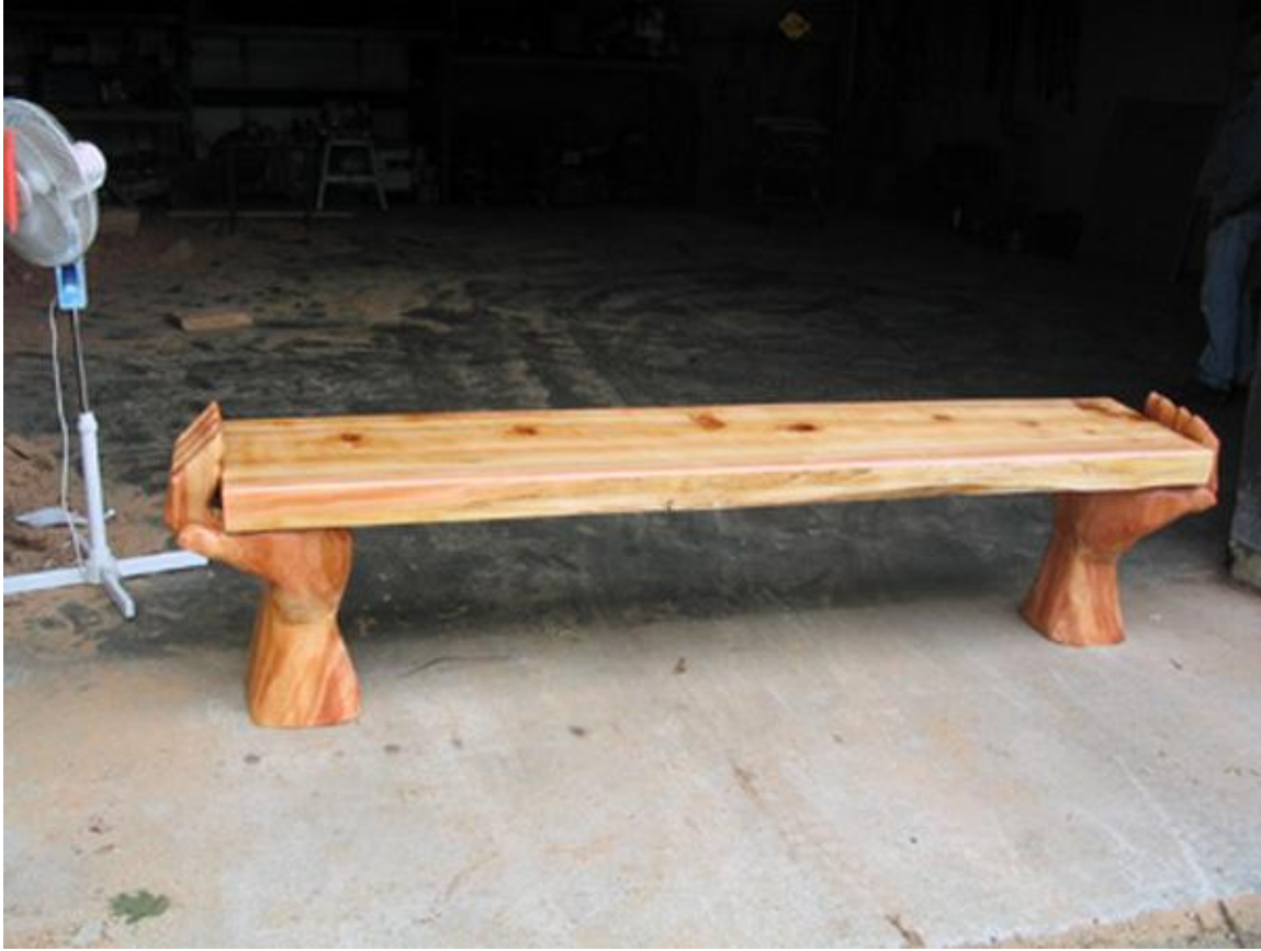
Bench for walking trail