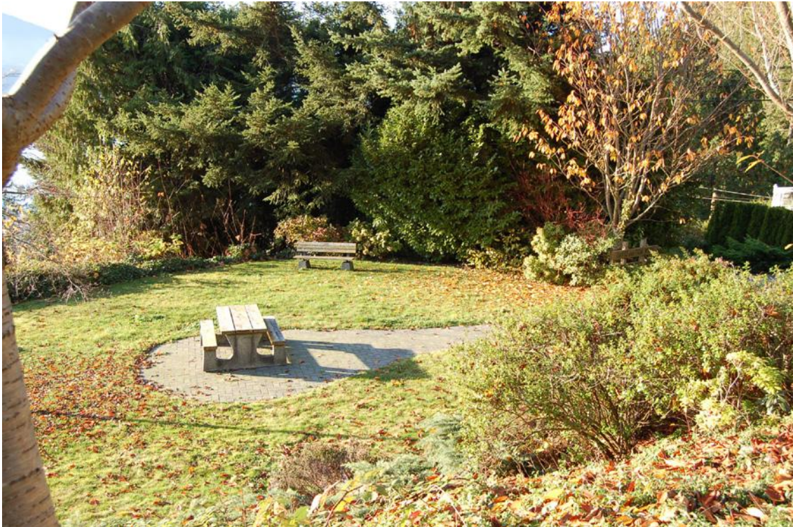
Passive Park at end of road