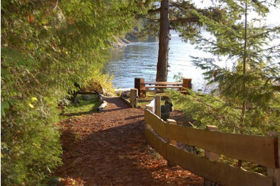
Beach park and walkway down to it.