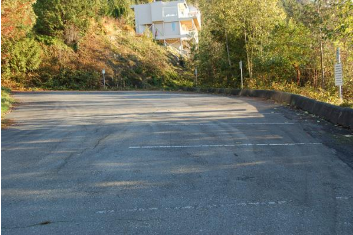
Parking lot that requires signage.

Measuring Up was created by 2010 Legacies Now in partnership with the Vancouver Agreement, the Province of BC and over 80 disability organizations throughout the province. Measuring Up helps BC communities assess and improve how accessible and inclusive they are for people with disabilities.