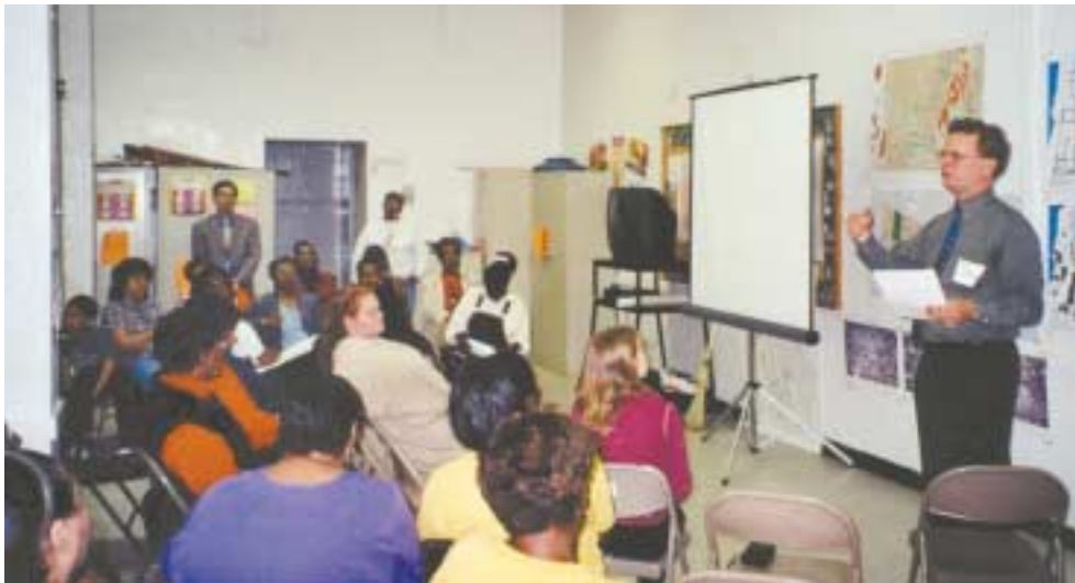
A facilitator gets the discussion started at the Mechanicsville charrette.