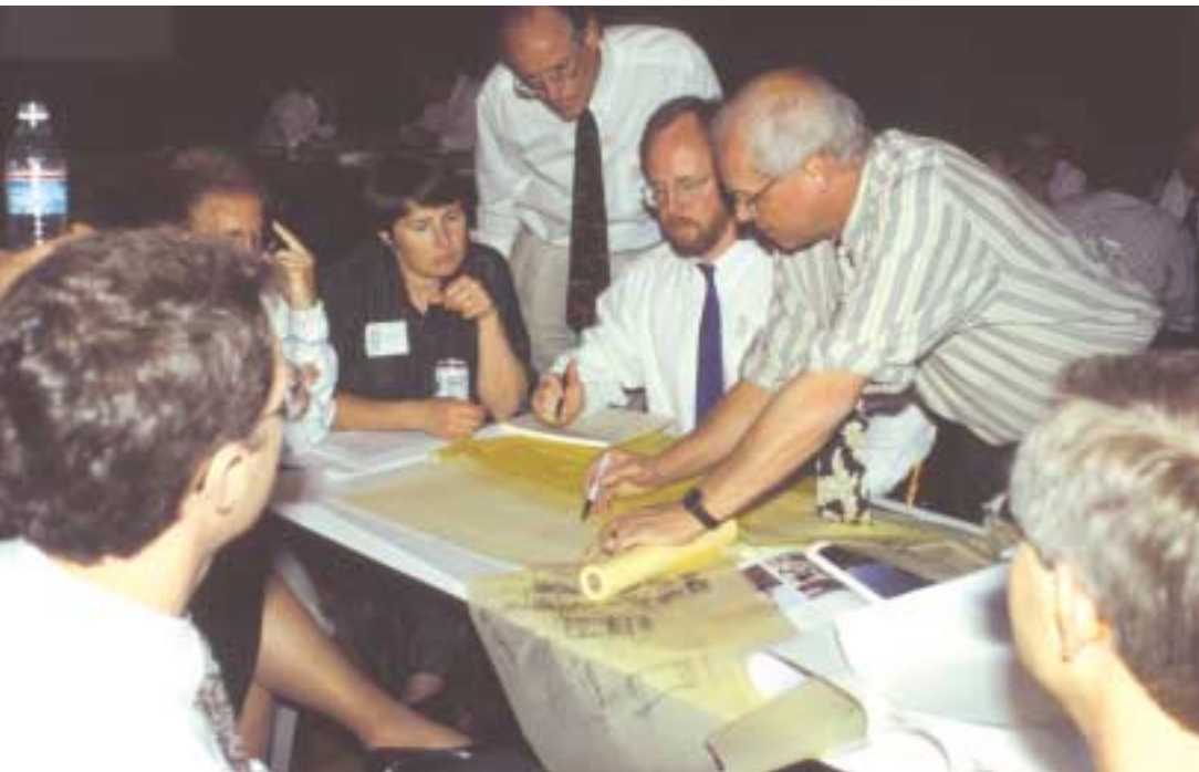
Throughout the event, participants generate a multitude of drawings, diagrams, maps, and checklists for designers to use in building plans.