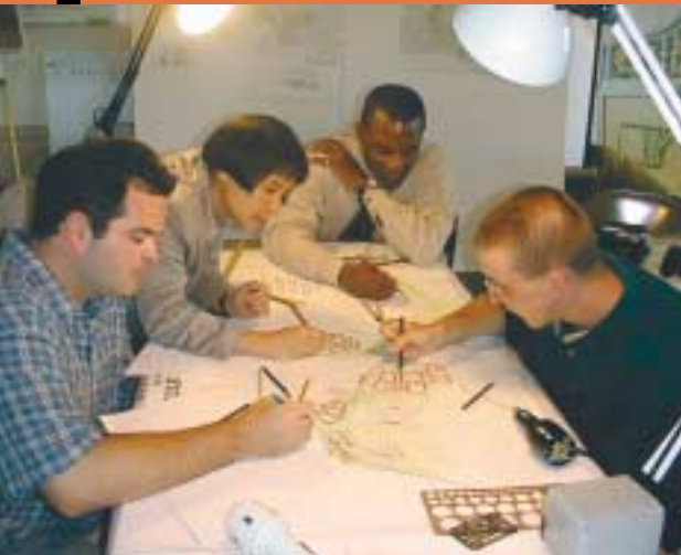
Charrette participants brainstorm on the position of neighborhood houses. Photo courtesy of Dover Kohl & Partners.

Source: “NCI Charrette Start-Up Kit: Key Tools for Getting Smart Growth Built,” CD-ROM, ©2003.